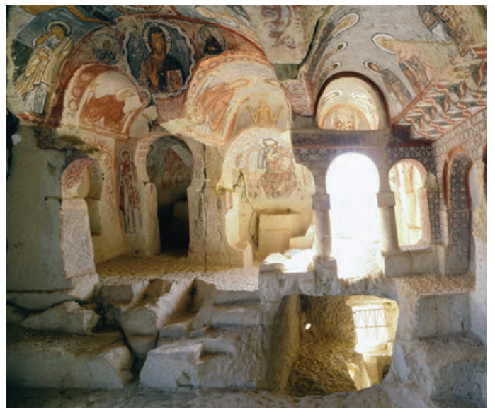
MERYEM ANA KILISESİ

Just outside the national park, our next stop will be the eleventh-century Meryem Ana Kilisesi (Church of the Virgin Mary), a 2008 World Monuments Watch site. Lunch will be served at a local restaurant, and we will check in to our hotel, the Argos in Cappadocia Hotel, in Uchisar, in the late afternoon, followed by sunset cocktails on the terrace of the recently restored Sarıca Church.