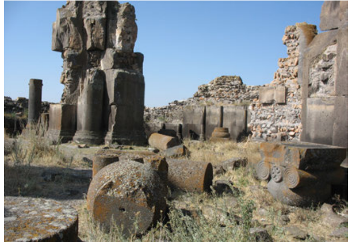
ST. GREGORY OF GAGIK, ANI

After breakfast, we will check out of our hotel and travel via coach for a morning excursion back to Ani, where we will walk the northern route and visit the Palace, St. Gregory of Gagik, the Church of St. Gregory Abugamrentz, the Church of the Holy Apostles, and the Citadel.