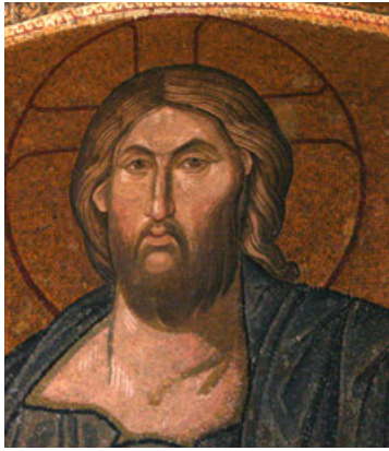
MOSAIC AT THE KARIYE MUSEUM

Church of Christ in the Chora Monastery), one of the oldest monasteries in the city. Listed on the 2004 World Monuments Watch, the church was rebuilt and lavishly decorated in the early fourteenth century, converted into a mosque during the Ottoman era, became a museum in the mid-twentieth century, and presently houses some of the finest examples of