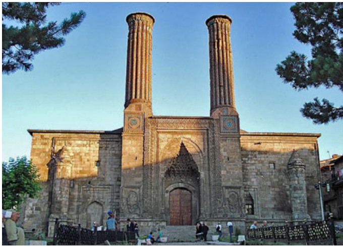
ÇIFTE MINARELI MEDRESI

decorated Georgian cathedral completed in 1032.