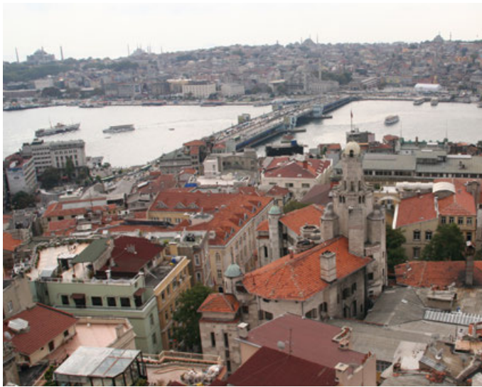
THE VIEW FROM BEYOĞLU

After breakfast we will board a coach and travel to Rüstem Paşa Mosque in Eminönü, famous for its interior tiles from the sixteenth century. After visiting the Mosque,