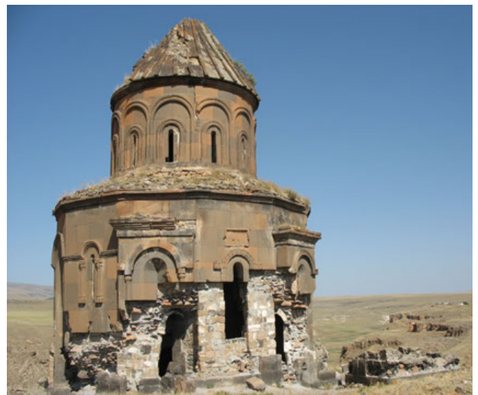
ST. GREGORY ABUGAMRENTZ, ANI

We will have lunch at a local restaurant on the way to the Kars airport and take a 2:45 p.m. flight back to Istanbul, arriving at around 5 p.m.